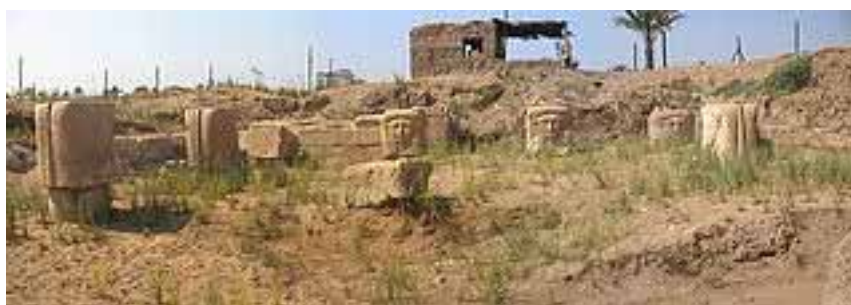
Ruins in Memphis