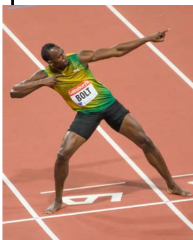
Usain Bolt at the 2013 London Anniversary Games

Read the text above and decide what the things explained in sentences below are, please.